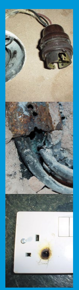
Typical examples of potentially dangerous electrical installations